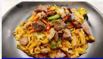
PANCIT CHAMI P299