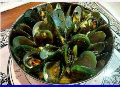
MEJILLONES AL VINO BLANCO P399 Mussels in white wine and parsley