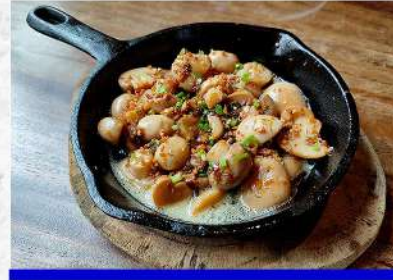
CHAMPIÑÓN AL AJILO P299 Mushroom in olive oil and garlic