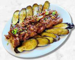
PORK BINAGOONGAN P599