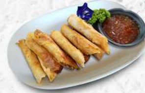
LUMPIANG GALUNGGONG P299