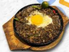
CRISPY BAGNET SISIG P399