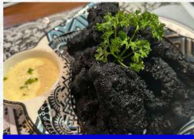
CALAMARI NEGRA P399 Squid ink breaded calamari