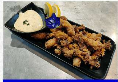
CHIPIRONES FRITOS P399 Crispy Fried Baby Squid