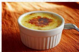
CREMA CATALANA (Creme Brulee) P199