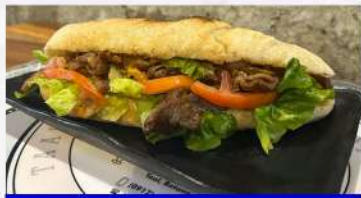
TAPA SANDWICH P259