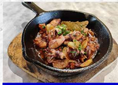
CHIPIRONES EN ACEITE DE OLIVA P399 Baby squid in olive oil & garlic