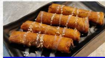
BANANA TURON W/ LANGKA P149