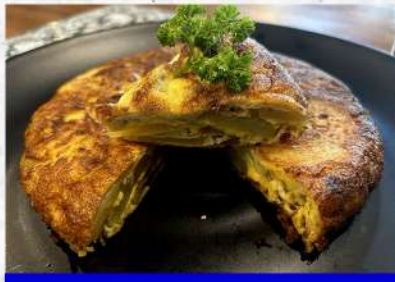
TORTILLA ESPAÑOLA P399 Traditional spanish potato omelette