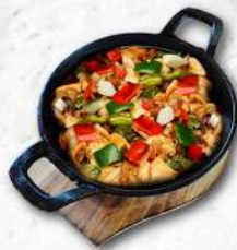
SIZZLING PUSIT P399