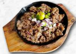
PORK SISIG P379