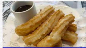
CHURROS CON TSOKOLATE P199