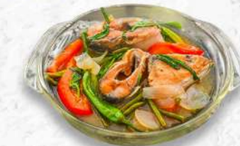
SINIGANG NA SALMON W/ HIPON SA MISO P699