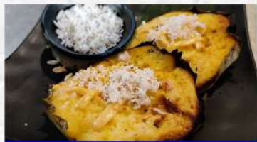
BIBINGKA GALAPONG P199