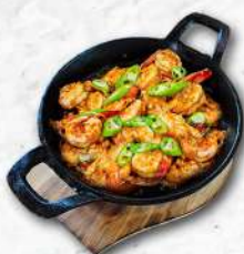
SIZZLING GAMBAS P429