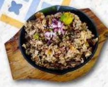
BANGUS SISIG P349