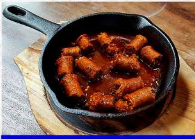
CHORIZO FRITOS P399 Fried Spanish Sausage