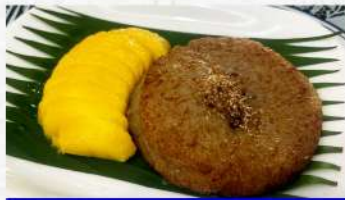
SUMAN TAAL W/ RIPE MANGO P229