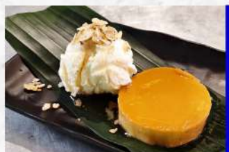
LECHE FLAN W/ VANILLA ICE CREAM P179