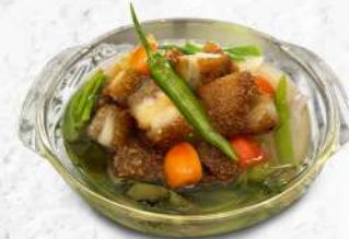
SINIGANG NA BAGNET P649